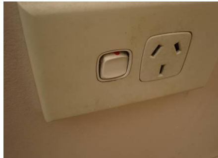
A loose switch to a power point needs repair as soon as possible