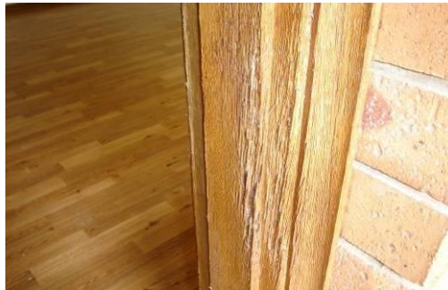
Doorway and flyscreen damage caused by a pet