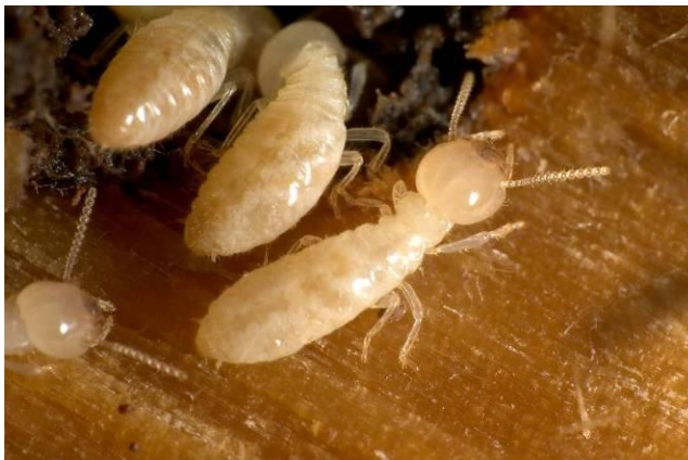
Termites are small and very destructive! (Picture not to scale)