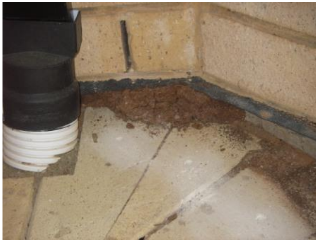
These mud deposits indicate active termites

If you see any signs of termites, or termite damage please bring this to our attention immediately.