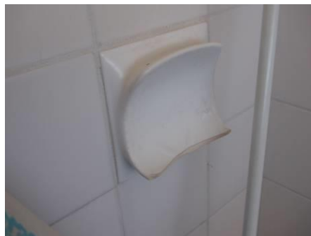
This broken soap dish in the shower could cause injury and needs to be replaced.