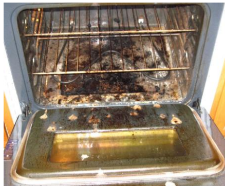
This oven has baked on food and grease making it very difficult and will be costly to clean.

Please use care when using scourers as these may scratch and damage enamel surfaces. When cleaning stoves/ovens use a spray-on oven cleaner. Be sure to read and follow the product instructions carefully, as even though these types of products are very effective, they tend to contain harmful caustic fumes and require rubber gloves to be worn at all times when using the product. Please also check that the product is suitable to the type of surface you are applying this to, as some surfaces like stainless steel may become permanently marred/stained using an oven cleaner.