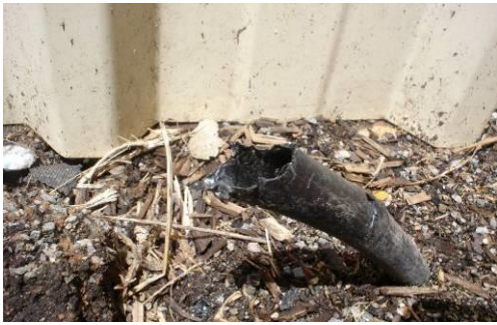
Irrigation and lawn damage caused by a pet